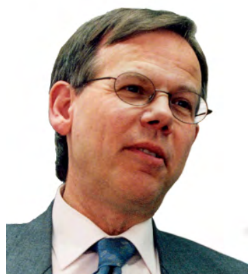
By PETER WALKER

As an alternative, I offer these "Notes on