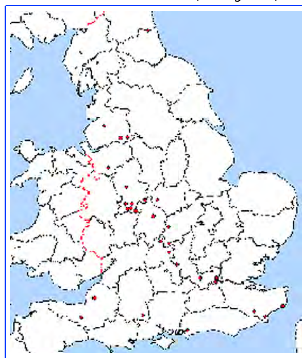
Figure 2 – Hollier distribution based on 1842-1846 deaths